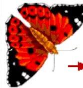
Pulelehua Maze Help the pulelehua find the koa tree.